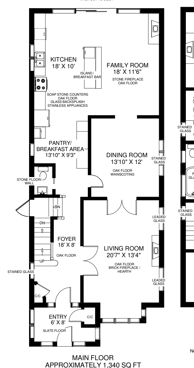
Note: Measurements & Calculations are approximate. Provided as a guideline only.