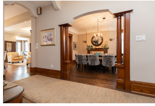
Check out the Youtube video at www.LovelyTorontoHomes.com

Office: 416.236.1392 Direct : 416.762.5949