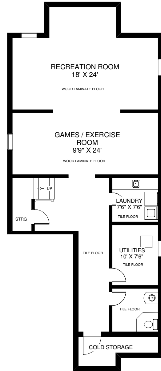
LOWER FLOOR APPROXIMATELY 1,300 SQ FT