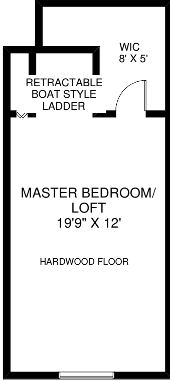
UPPER FLOOR APPROXIMATELY 370 SQ FT