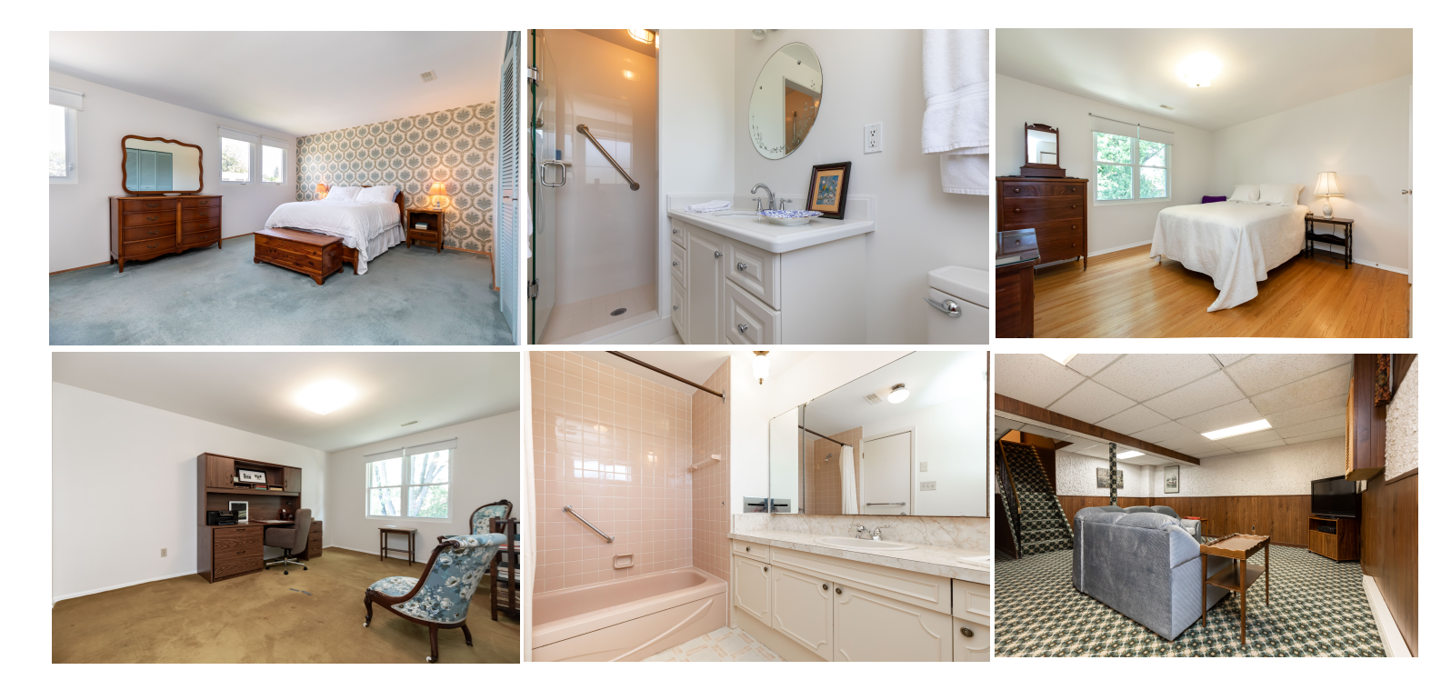
Check out the Youtube video at www.LovelyTorontoHomes.com