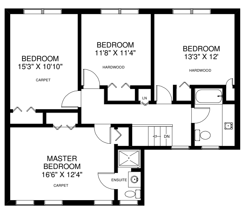
SECOND FLOOR APPROXIMATELY 1,060 SQ FT

Note: Measurements & Calculations are approximate. Provided as a guideline only.