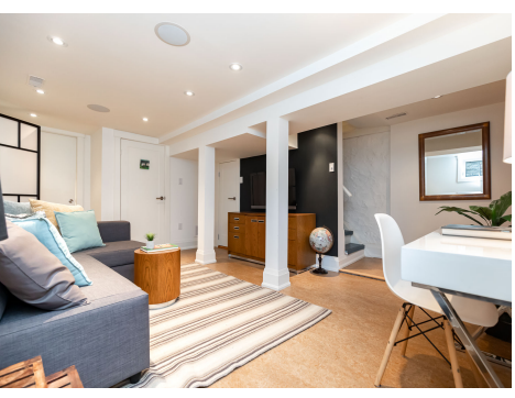
Check out the Youtube video at www.LovelyTorontoHomes.com