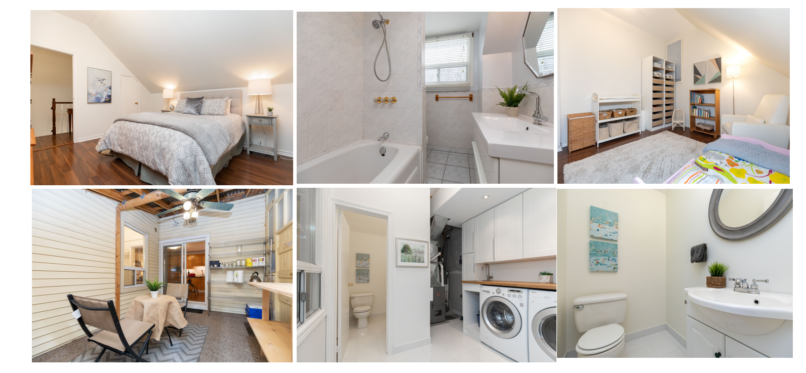
Check out the Youtube video at www.LovelyTorontoHomes.com!