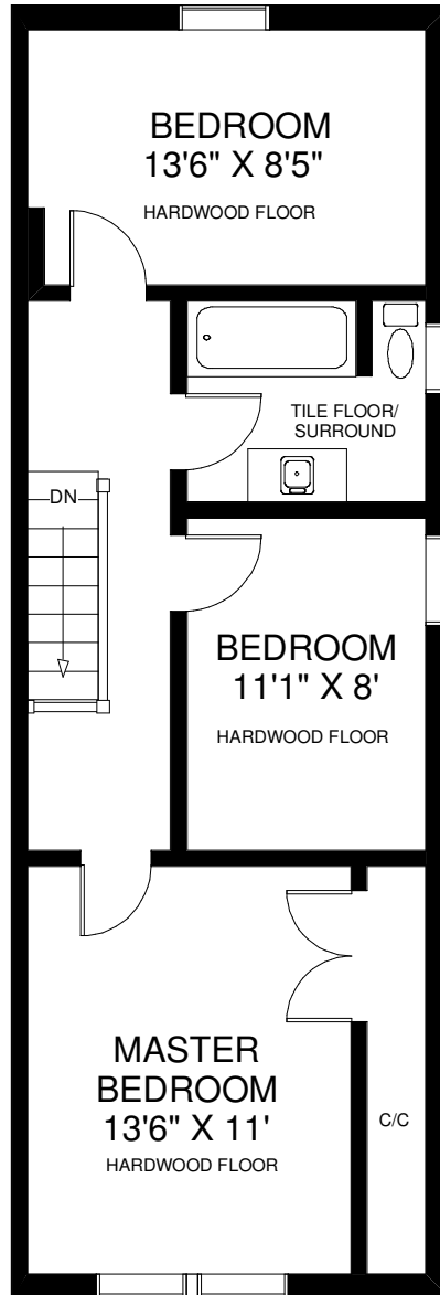
SECOND FLOOR APPROXIMATELY 620 SQ FT